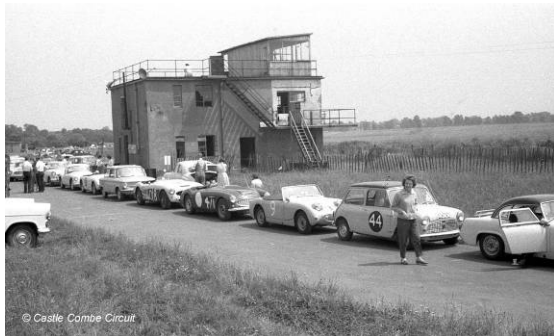
Austin-Healey club sprint, June 1963

Over the next few years, a handful of further sprint meetings were held at the track, but it wasn't until the BRSCC re-opened the circuit for car racing in 1962 that speed events became a frequent occurrence at Castle Combe. The remainder of the 1960s saw numerous sprints, peaking in the middle of the decade with nine or ten meetings per year.